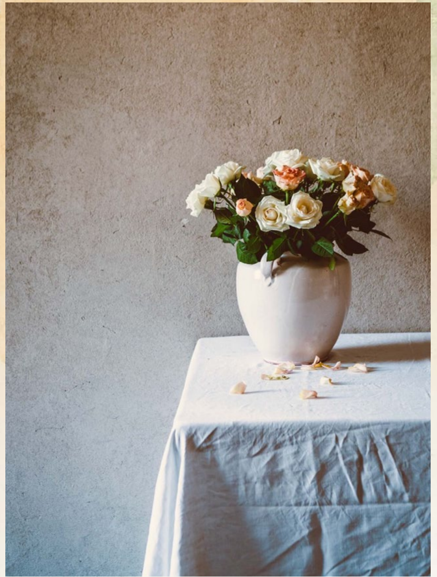
THE SALLE À MANGER