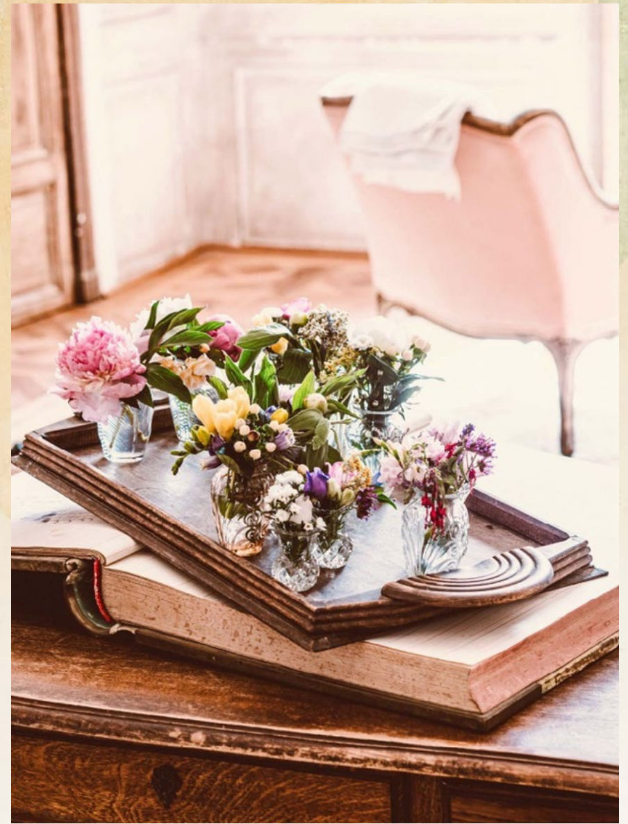
THE PETIT VESTIBULE