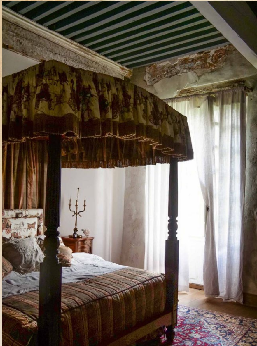
CHAMBRE MARIE-LOUISE LACHAPELLE