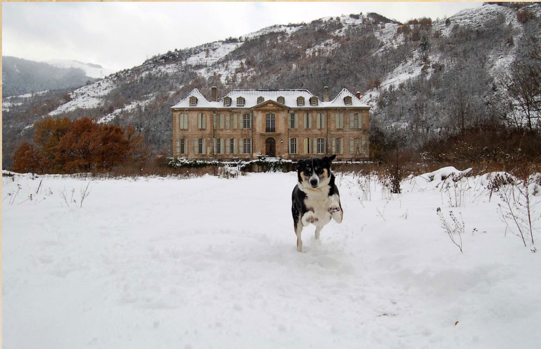
CHÂTEAU DE GUDANES IN WINTER