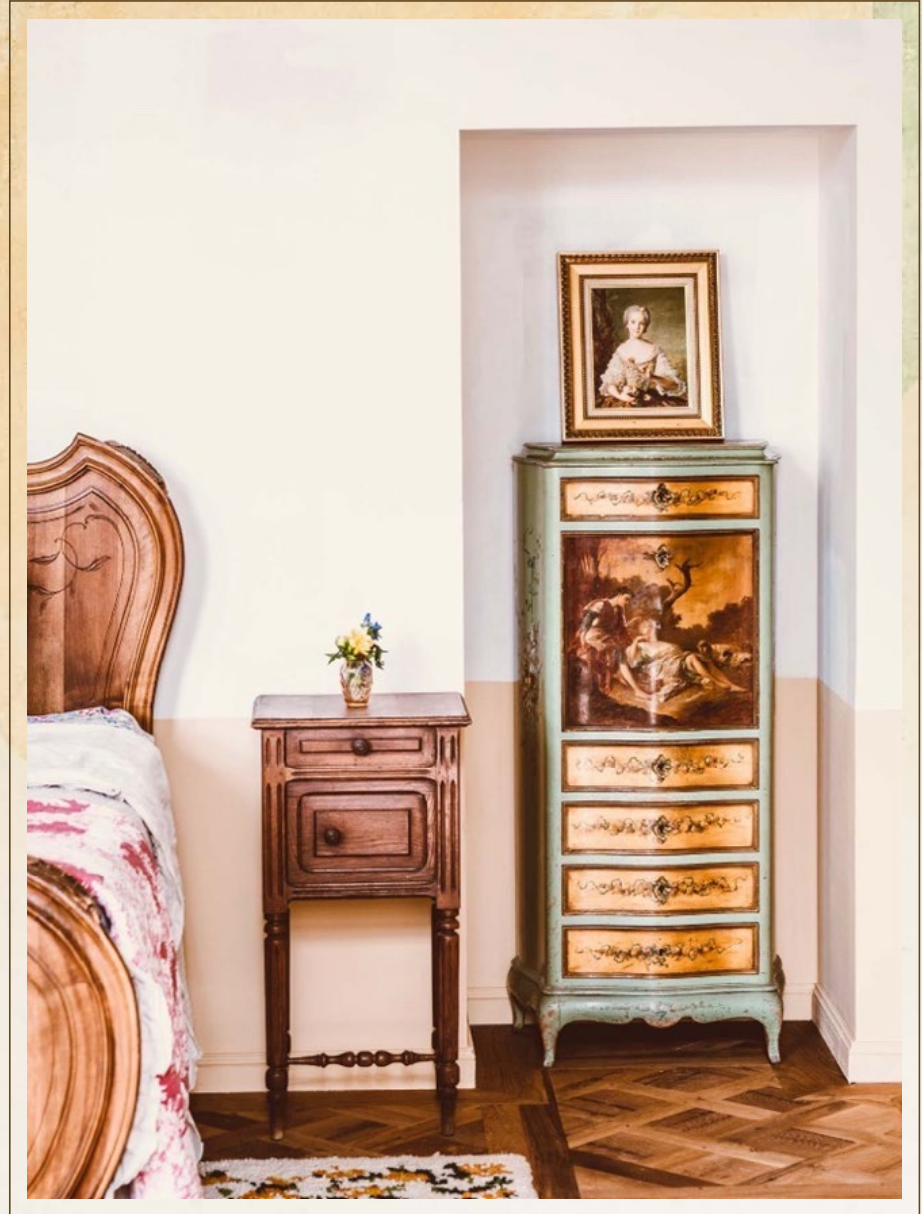
CHAMBRE ÉMILIE DU CHÂTELET