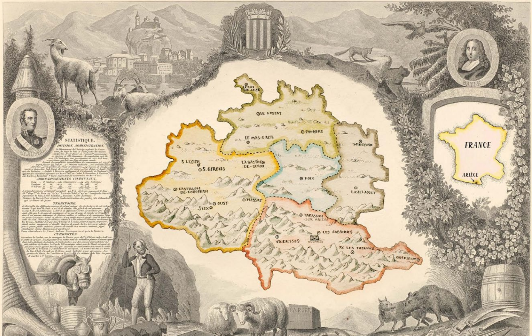
CHÂTEAU DE GUDANES LOCATION