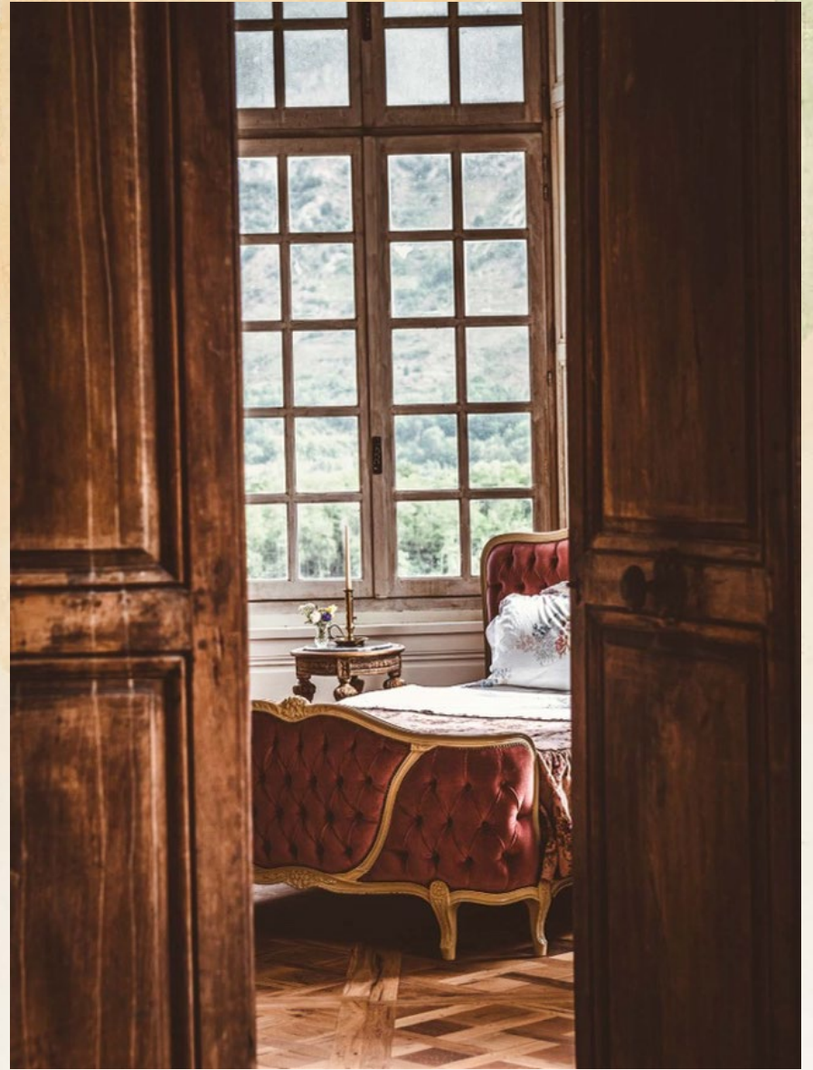
CHAMBRE MARIE MARVINGT