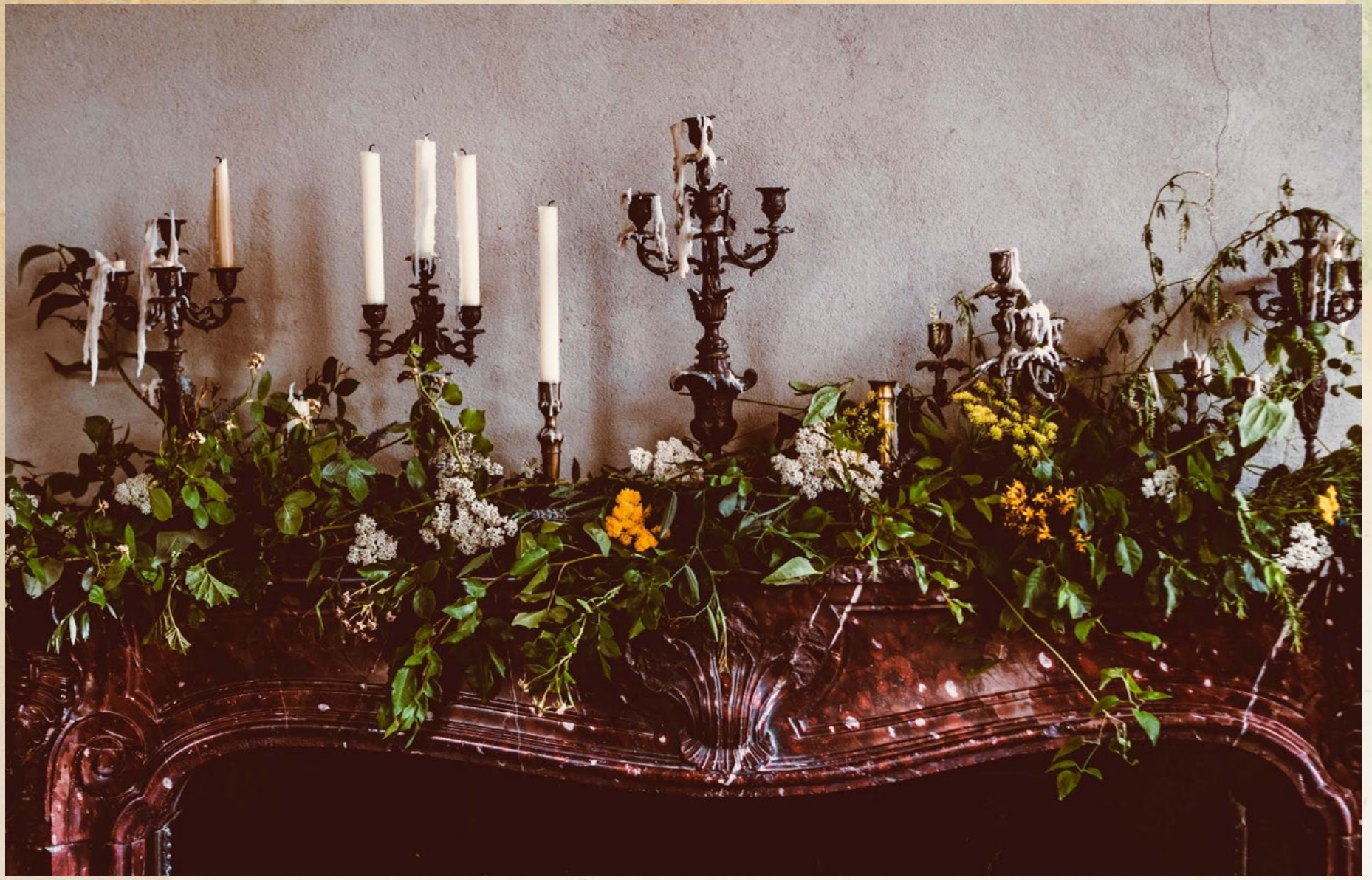
THE SALLE À MANGER