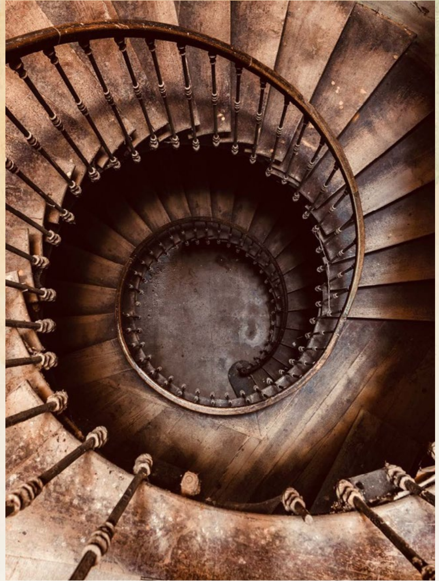
THE WINDING STAIRCASE