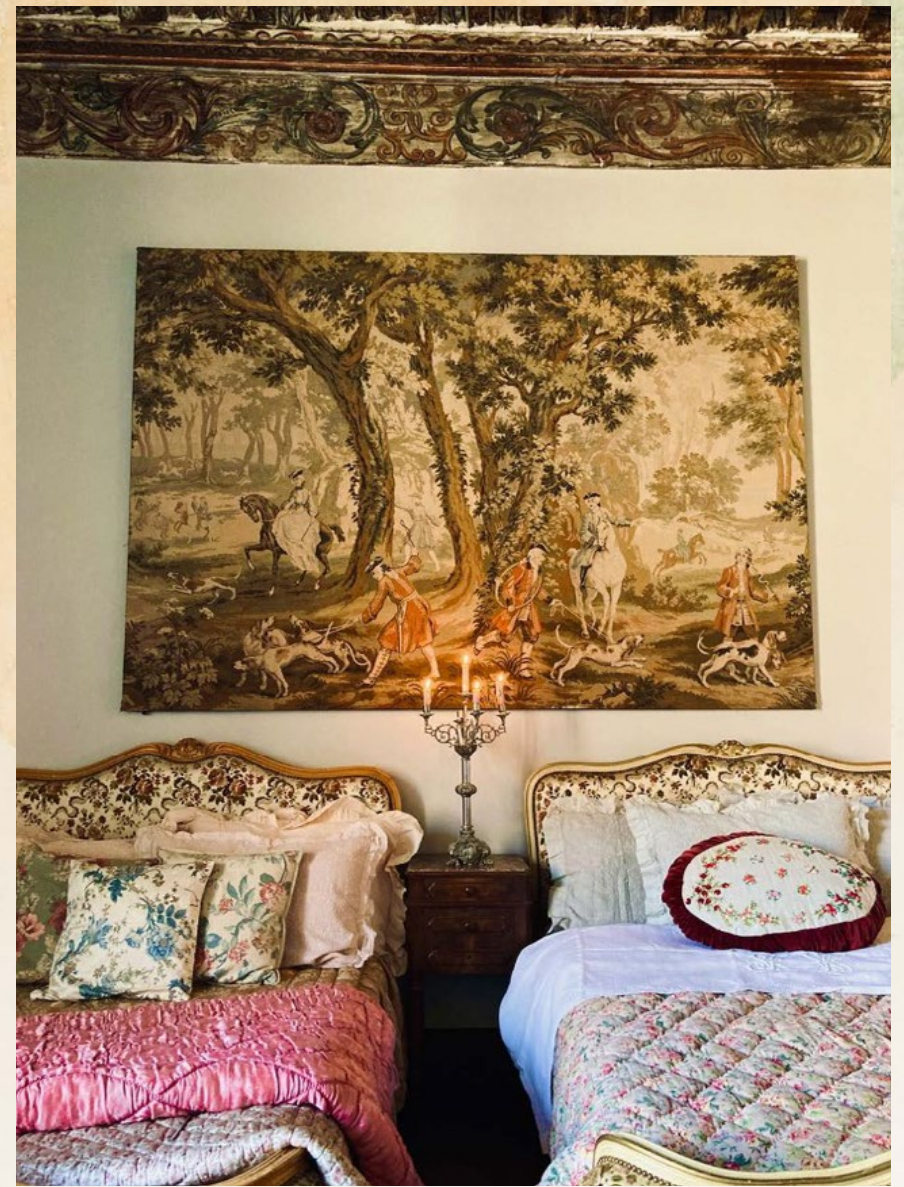
CHAMBRE JEANNE D'ARC