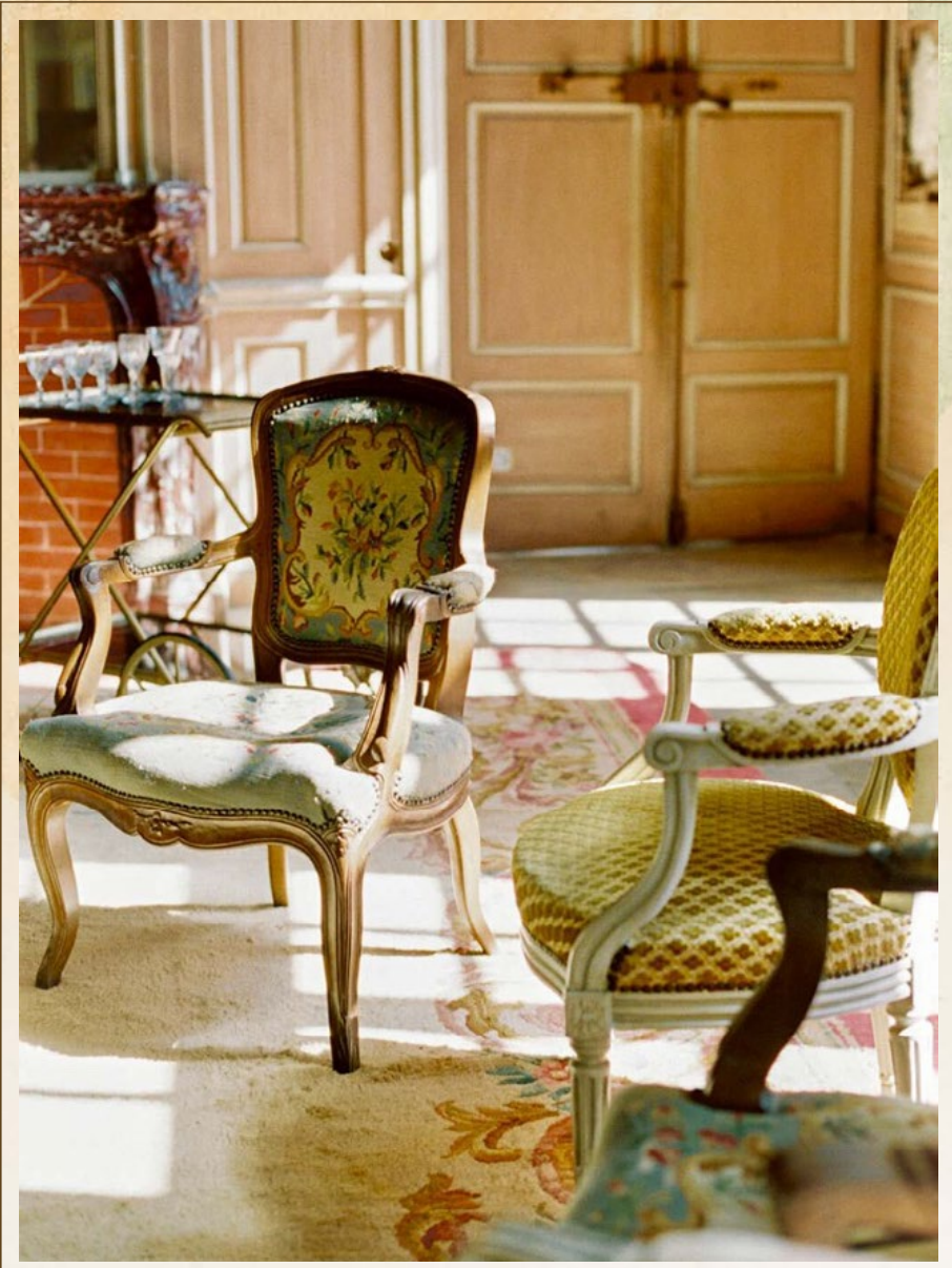
THE SALON DE ROSE