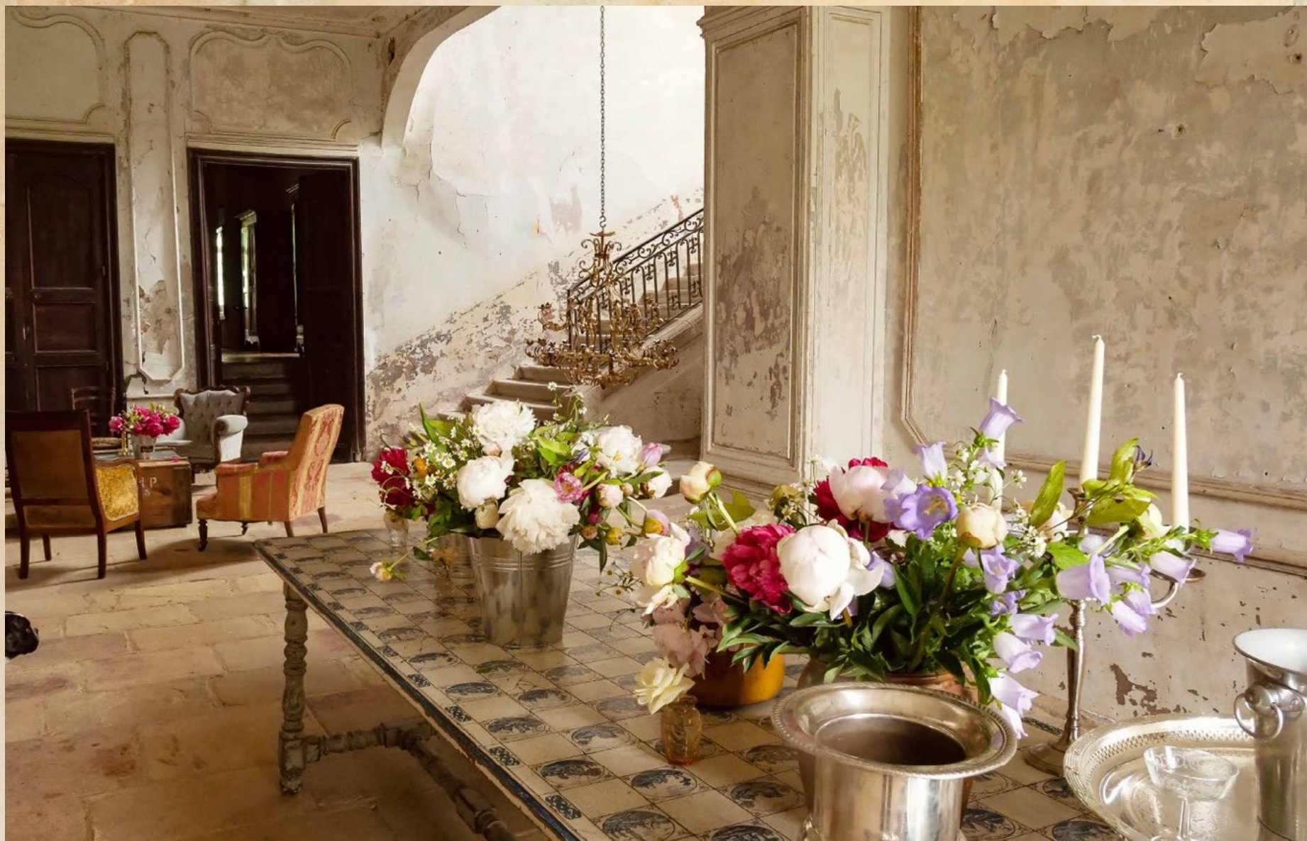
THE GRAND VESTIBULE & STAIRCASE