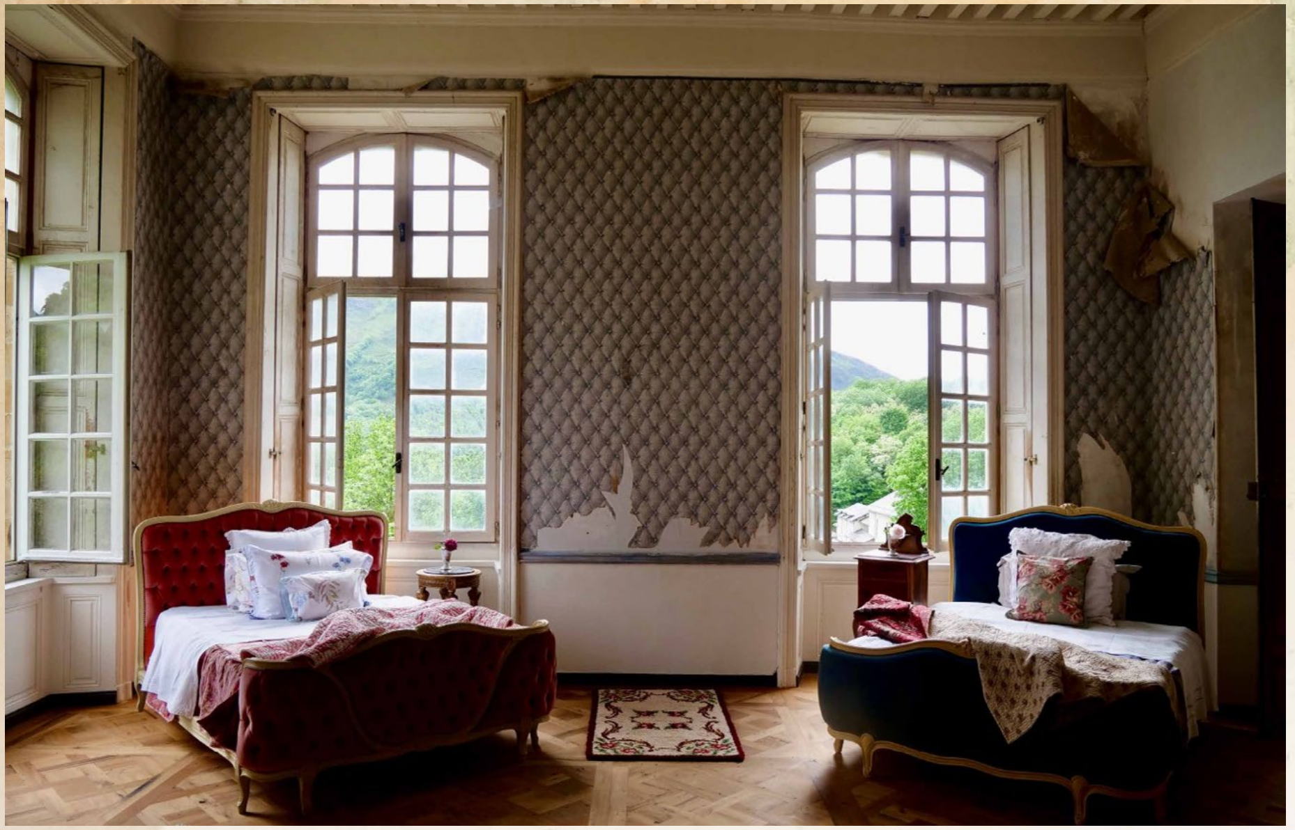
CHAMBRE MARIE MARVINGT