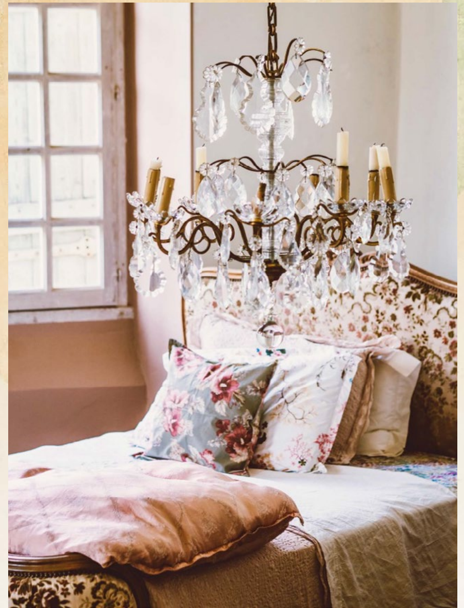
CHAMBRE MARIE DE LORDAT