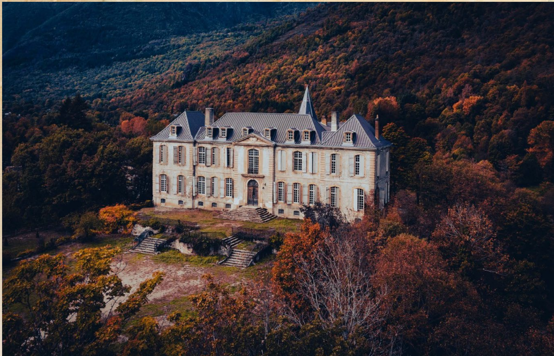
CHÂTEAU DE GUDANES IN FALL