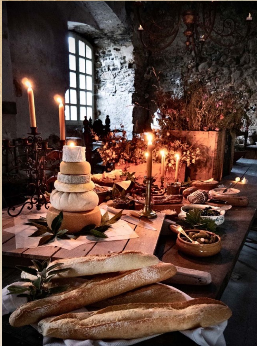
THE RENAISSANCE KITCHEN