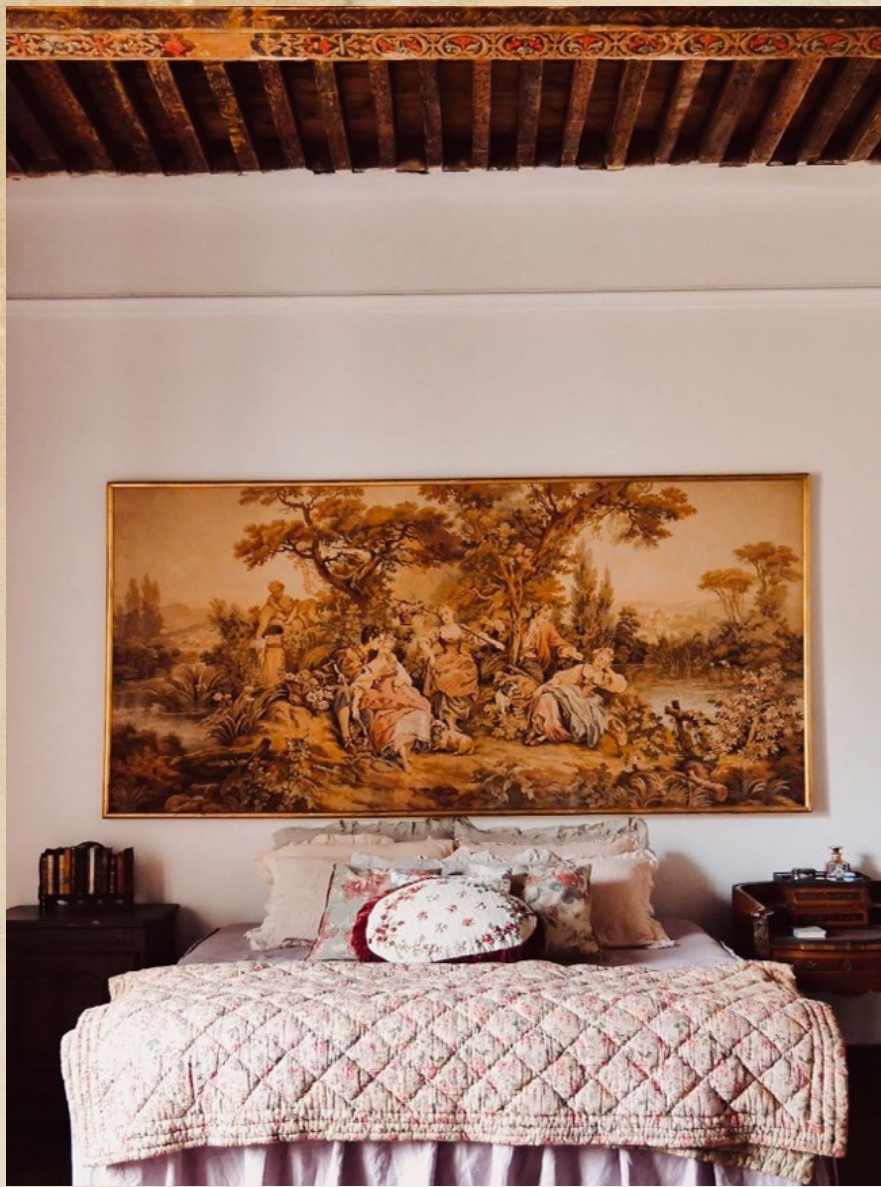
CHAMBRE OLYMPE DE GOUGES