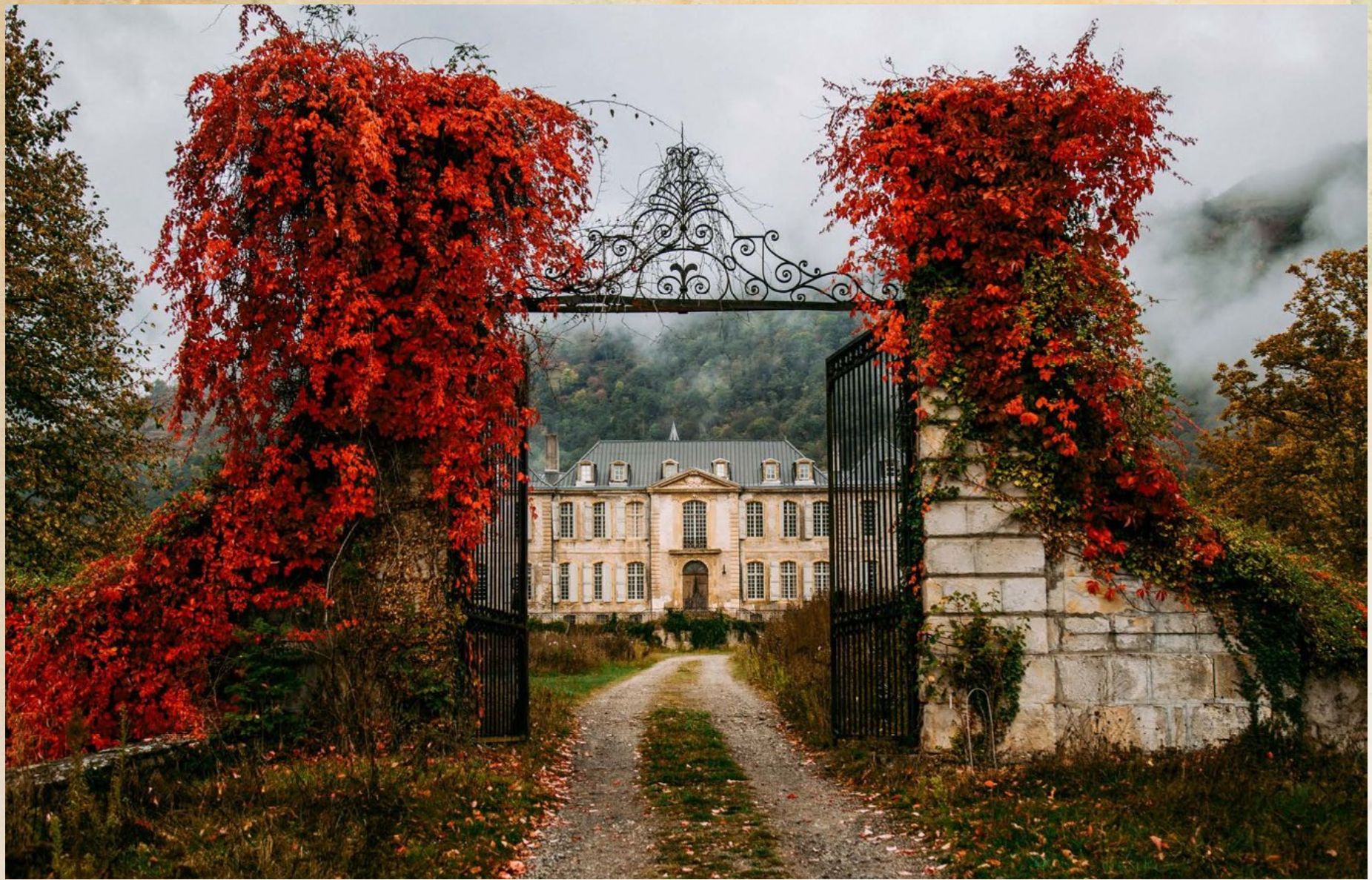
CHÂTEAU DE GUDANES IN FALL