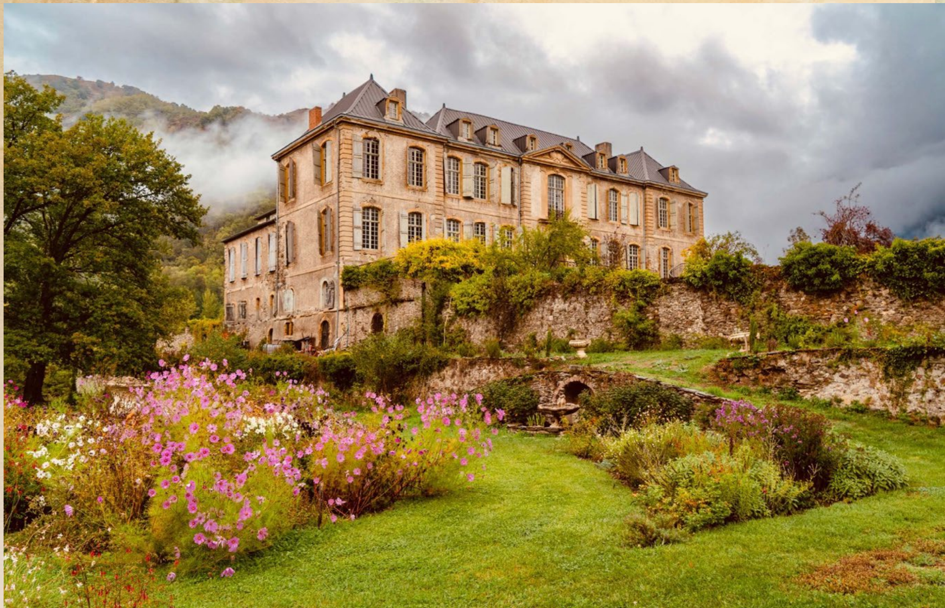
CHÂTEAU DE GUDANES IN SUMMER