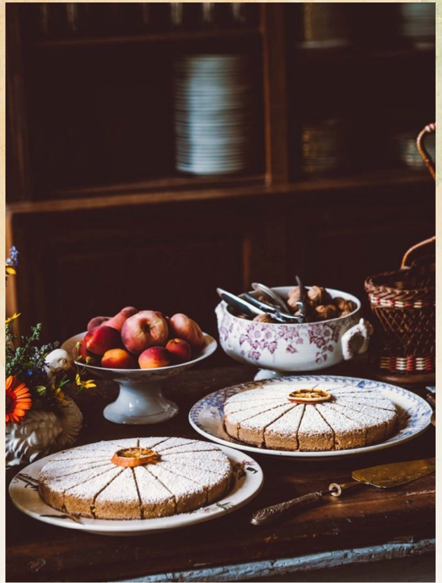
THE SALON DE PORCELAINE