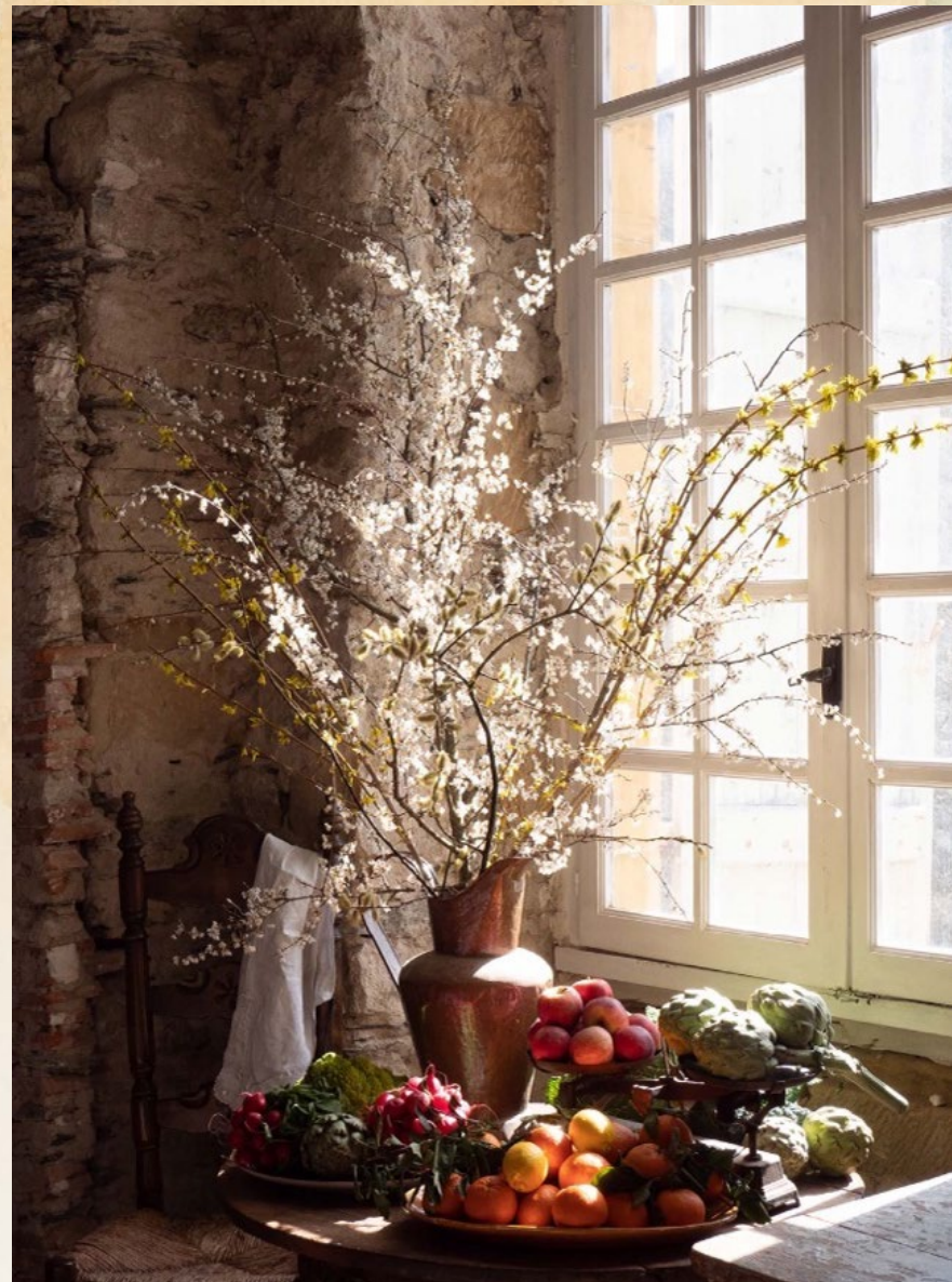
THE CHÂTEAU CUISINE