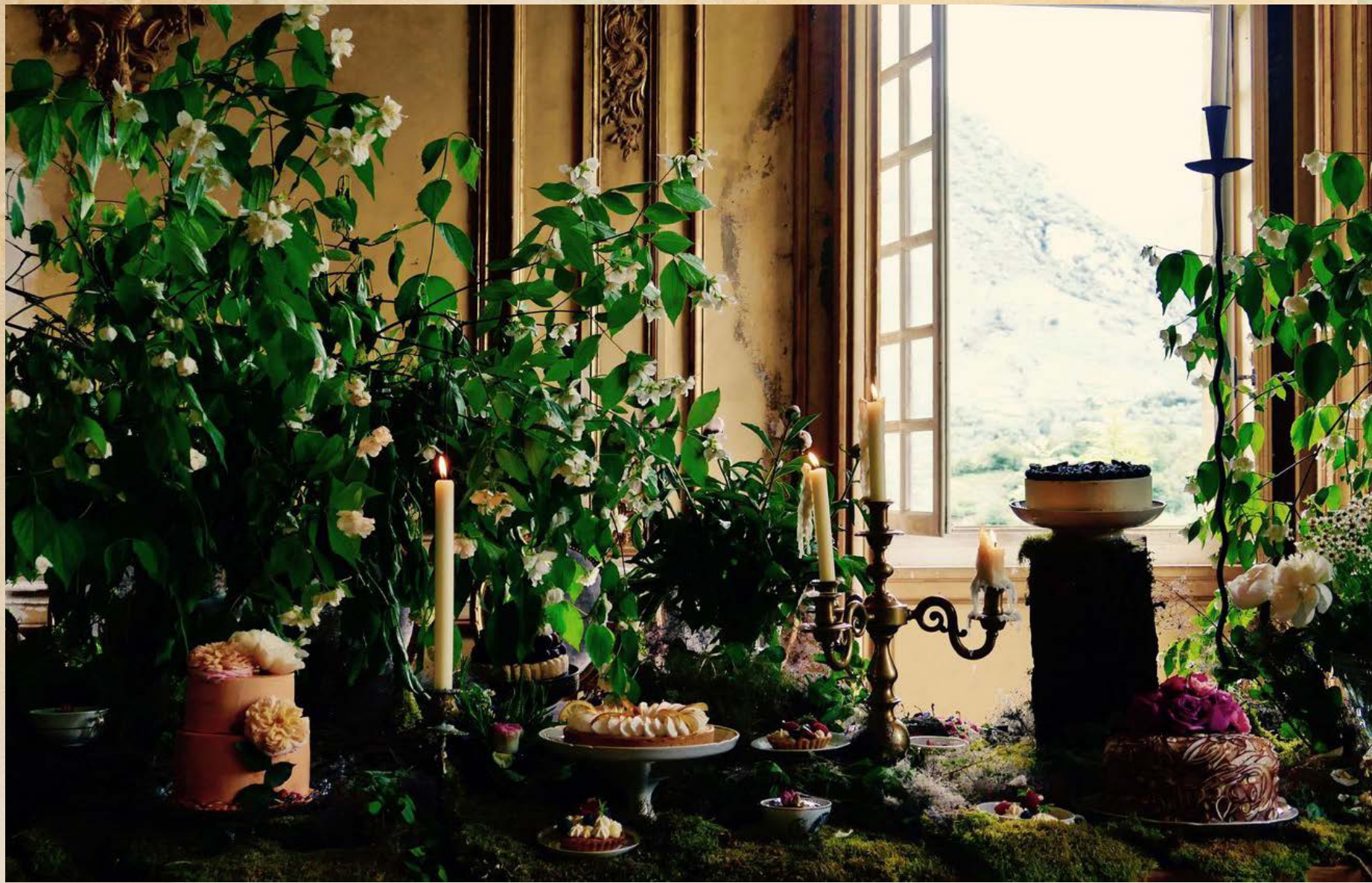
THE SALON DE MUSIQUE