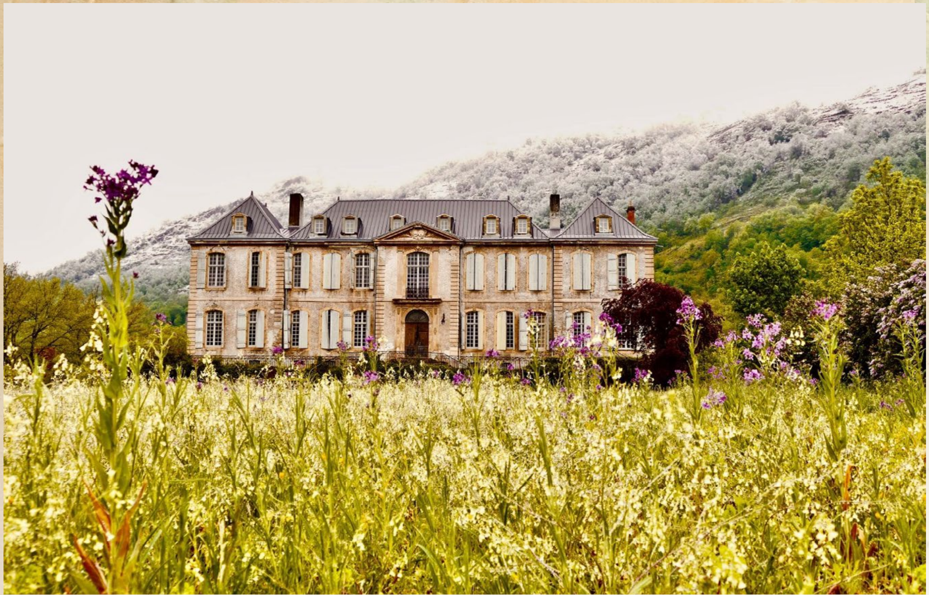
CHÂTEAU DE GUDANES IN SPRING