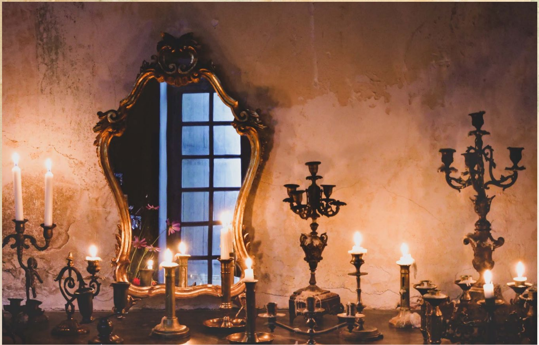
THE SALON DE PRINTEMPS