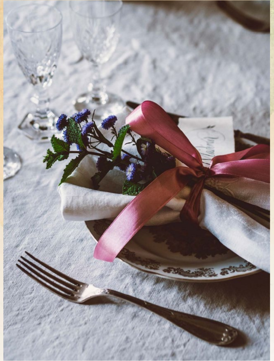
THE SALON DE PRINTEMPS