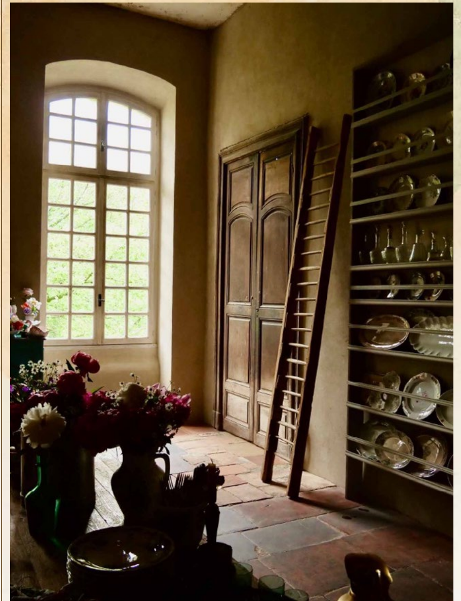
THE SALON DE PORCELAIN