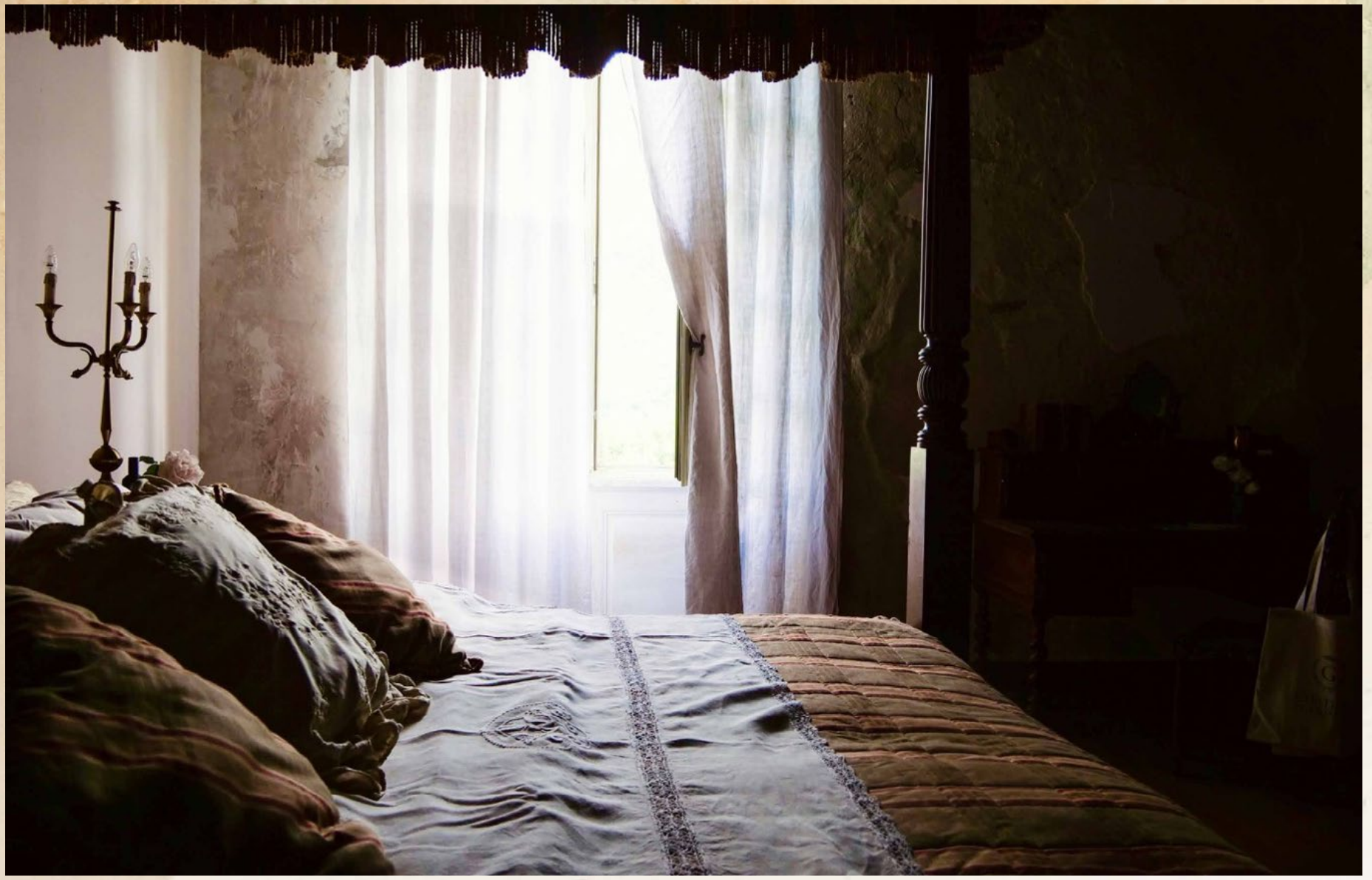
CHAMBRE MARIE-LOUISE LACHAPELLE