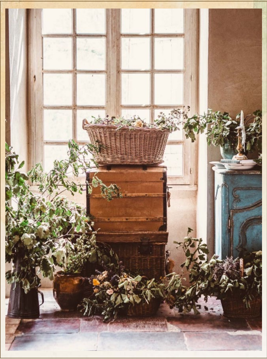
THE SALON DE PORCELAINE