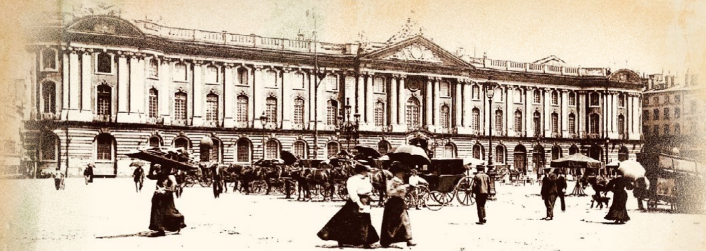
TOULOUSE — Le Capitole.